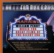
Featuring the Gemini Concerto with Ambra and Fiona Albek

NOVEMBER 2011 TOUR OF NEW YORK AND NEW ENGLAND Please visit albekduo.com for details